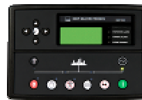
DSE-7320 Remote Control Panel